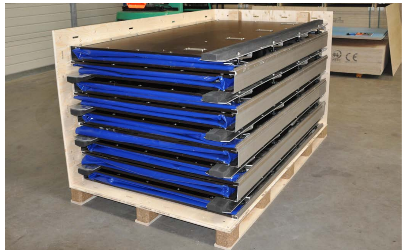
Clip-Lok returnable box with 4 flood protection barrier units.