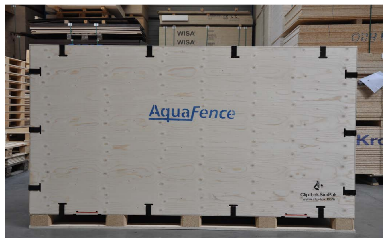
Clip-Lok returnable transport box loaded with flood protection barrier units secured and ready for transport.