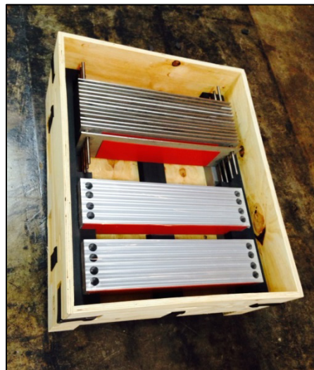
This box contains the hardware for the sculpture. Also here, robust fixed foam dunnage secures each part.