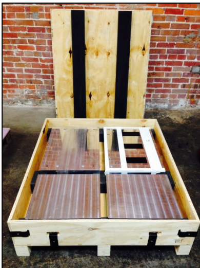
This box contains the base of the sculpture. All of the dunnage is integrated in the box so there is no need for additional packaging materials and no waste to dispose of.