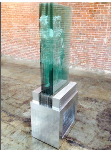
The sculpture consists of several sheets of cut glass with an aluminum and steel base. It is 183 cm tall and weighs around 600 kg.