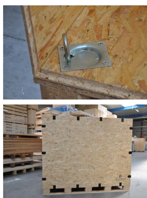
Clip-Lok Expendable box in different phases of the building up process along with the ring for strapping to provide protection and stability during transport.