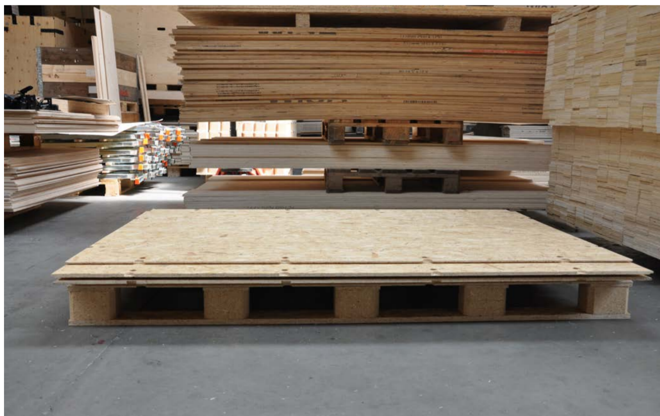
Clip-Lok Expendable box for grinding machines flat-packed.