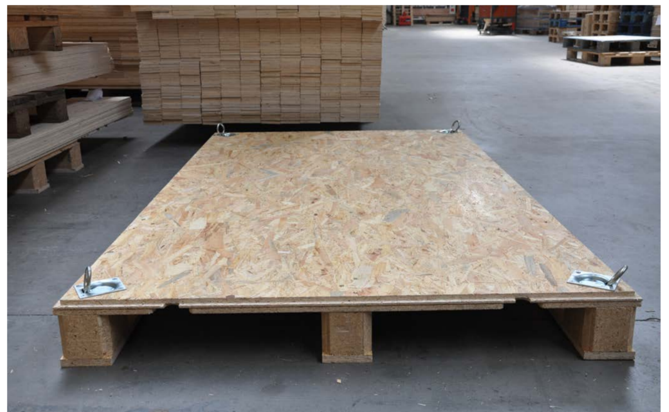
Clip-Lok Expendable box with rings at four corners of the pallet to strap the machine during transport.