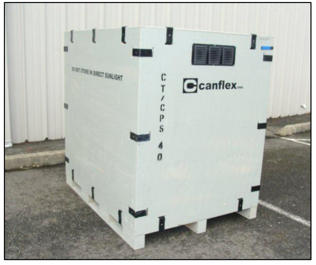
A packed box, ready for shipping. Heavy-duty plywood and custom design ensure safe transport of the bladder.