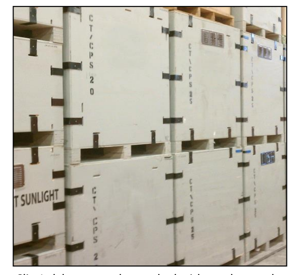
Clip-Lok boxes can be stacked without the need for racking.