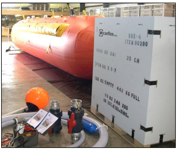
The emptied bladder will be folded into the box together with its accessories. The top and sides of the box are removable to allow easy access.