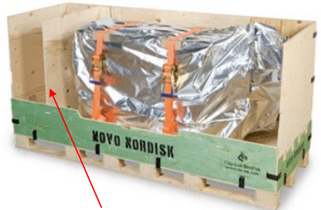
The 4 tonnes heavy casting mould is now secured in its position. The panel divider to the left creates room for safe packaging of ancillary equipment