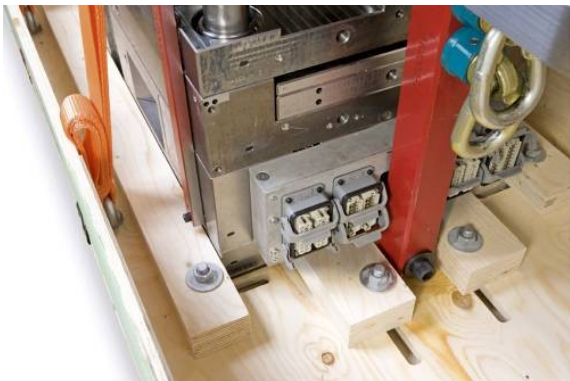
The blocks can be adjusted to match the size of the casting mould. The blocks hold the casting mould in position