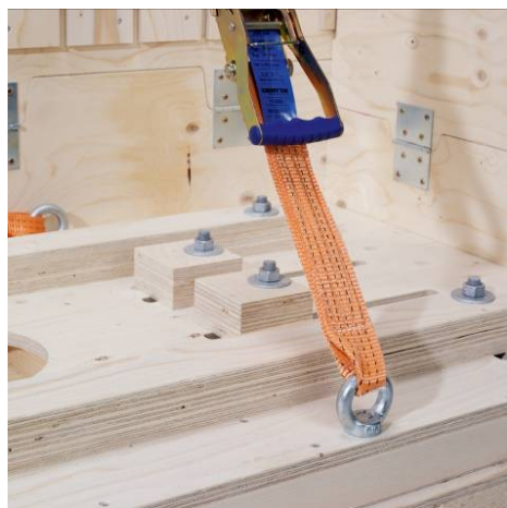
The straps are safely secured in the double pallet