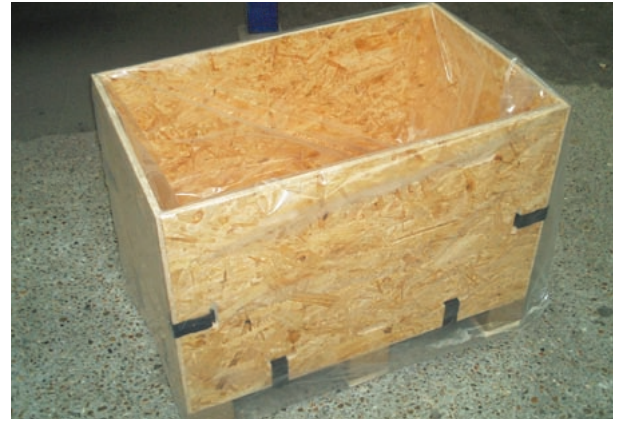
Above: Box with plastic inner liner, ready for packing