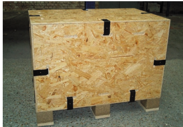
Left: Box filled with coins and closed ready for shipment.