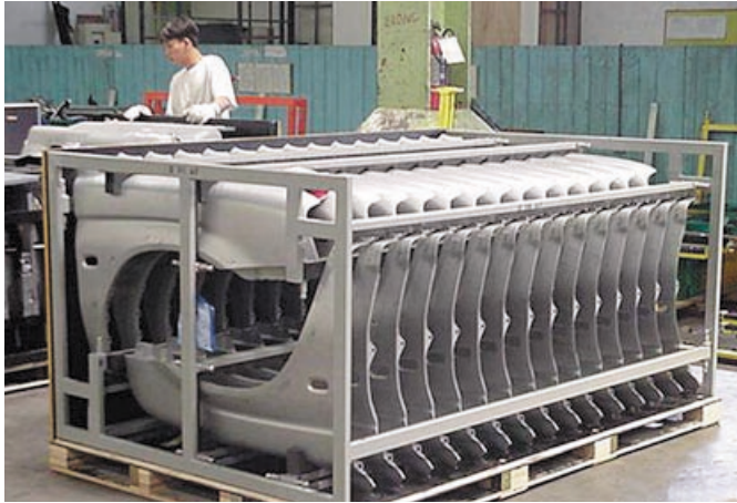
Above: Safe packaging of numerous front fenders

Complete CKD project for the transportation of Mitsubishi Pick-up Truck from Thailand to the Philippines for MMC Sittipol Co Ltd..