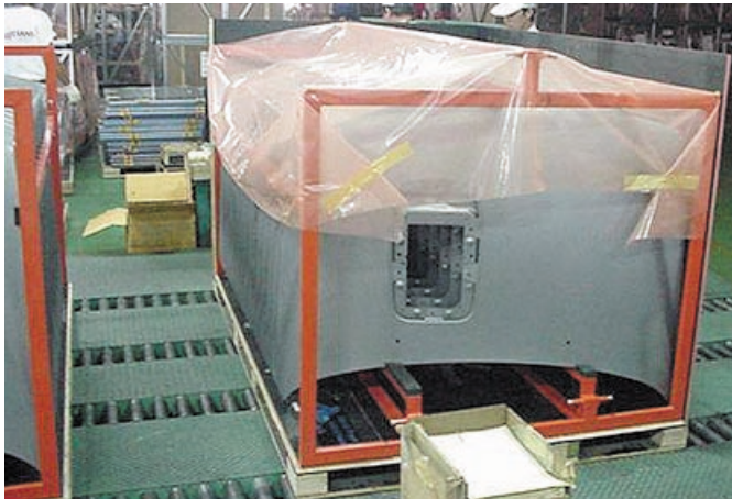
Above: Hoods packed ready for the panels to be erected