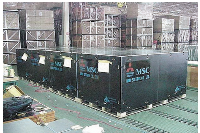
Above: Packed boxes in the conveyor line awaiting transport