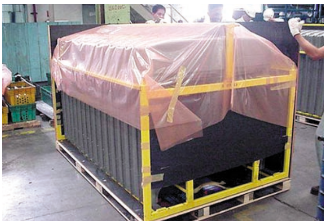
Above: Outer side panels await the building of the box