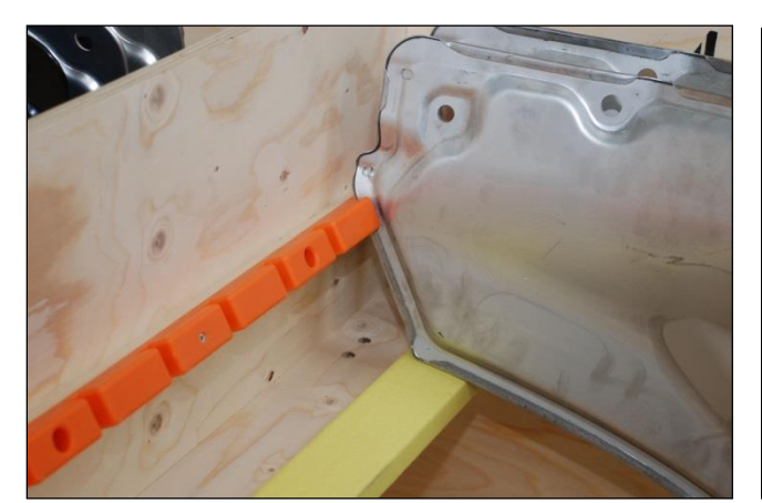
The metal door parts rest on a protective felt-lined shelf. This is especially important for preventing scratches or friction marks once the parts are painted.