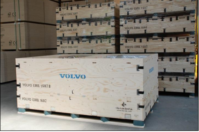
When the lid is placed and secured, the box will be ready for shipment. Behind the loaded box are stacked flatpacked boxes. The integrated pallet base allows 4-way handling.