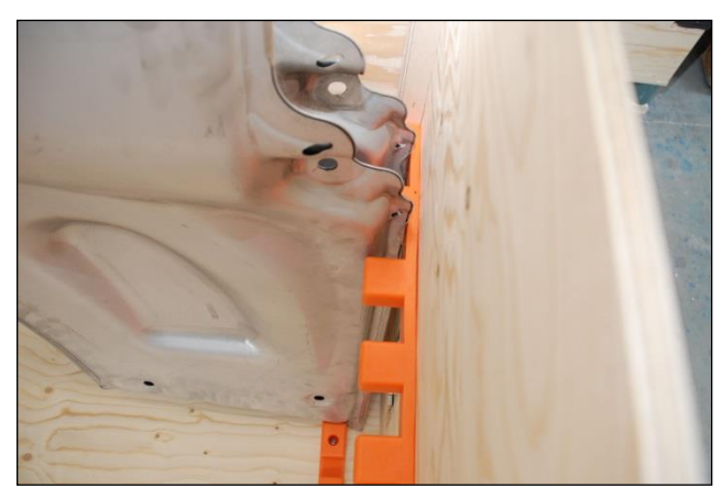
Robust polyurethane dunnage cradles each door part to prevent damage while maximizing packing density.