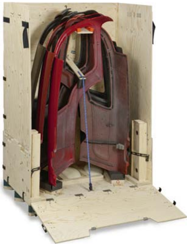
3 sets of sides, left and right, are safely placed in sequence.