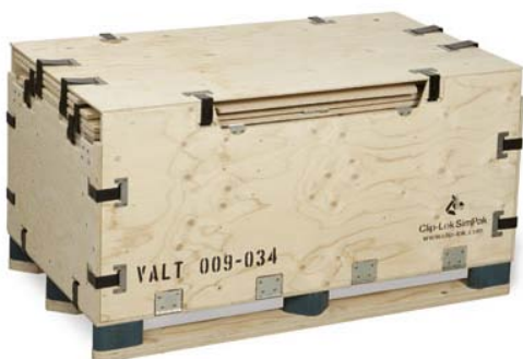
When dismantled the volume is reduced with 67% which reduce the costs of return shipments.