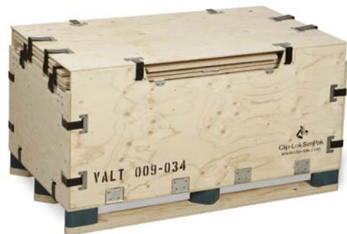
When dismantled the volume is reduced with 67% which reduce the costs of return shipments.