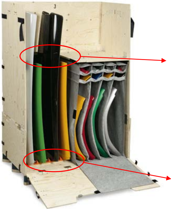
When open there is full access to all parts for unpacking in any order.