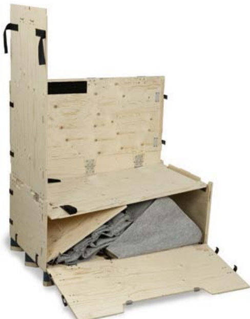
All dunnage folds into the Clip-Lok box when the box is dismantled