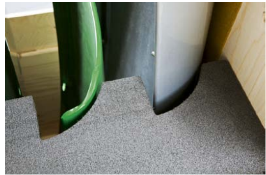
On top the parts are secured in foam