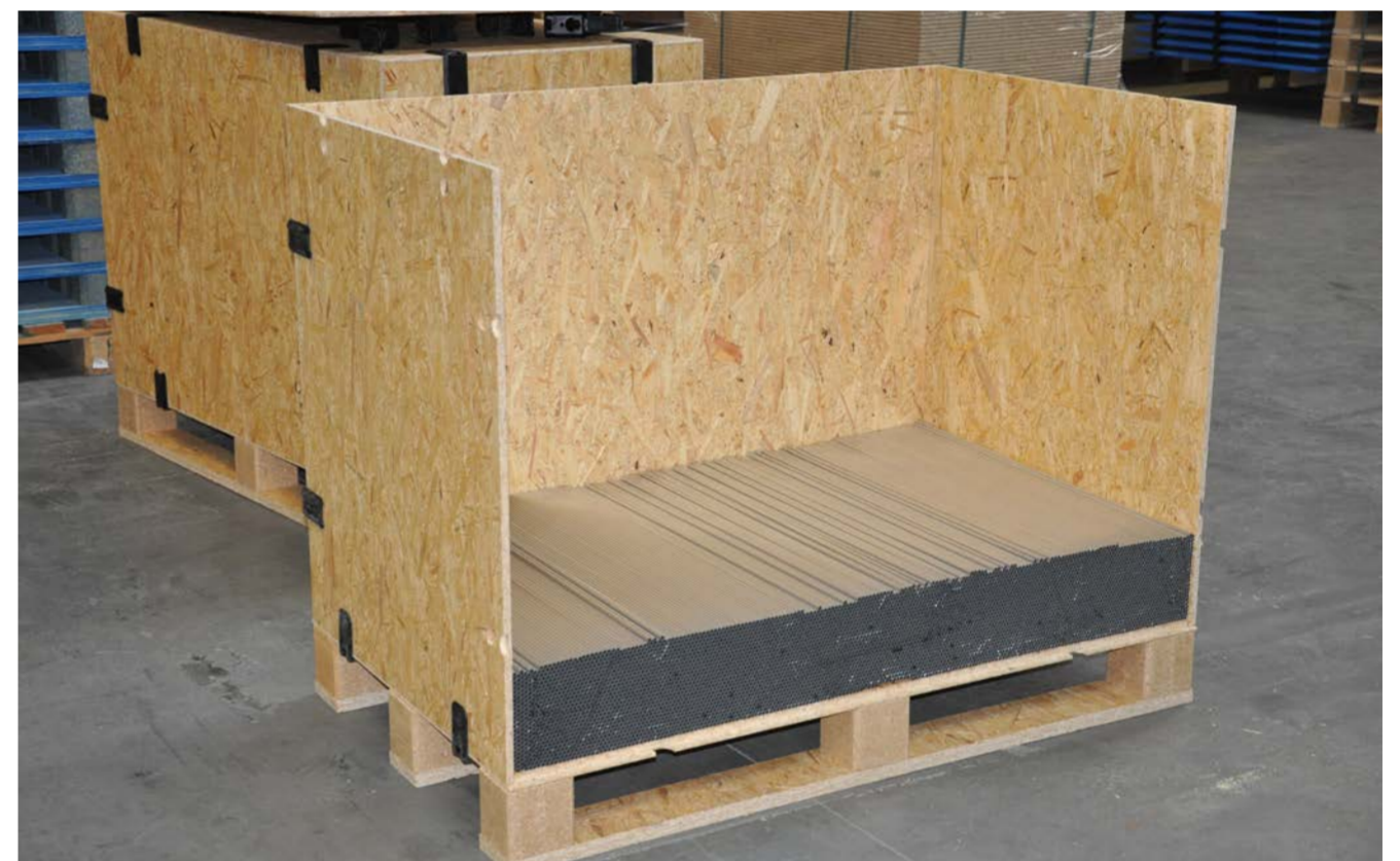
Clip-Lok Expendable box built up and loaded with aluminium profiles.