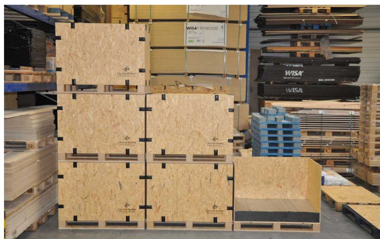
Clip-Lok Expendable box loaded with aluminium profiles stacked on top of each other.