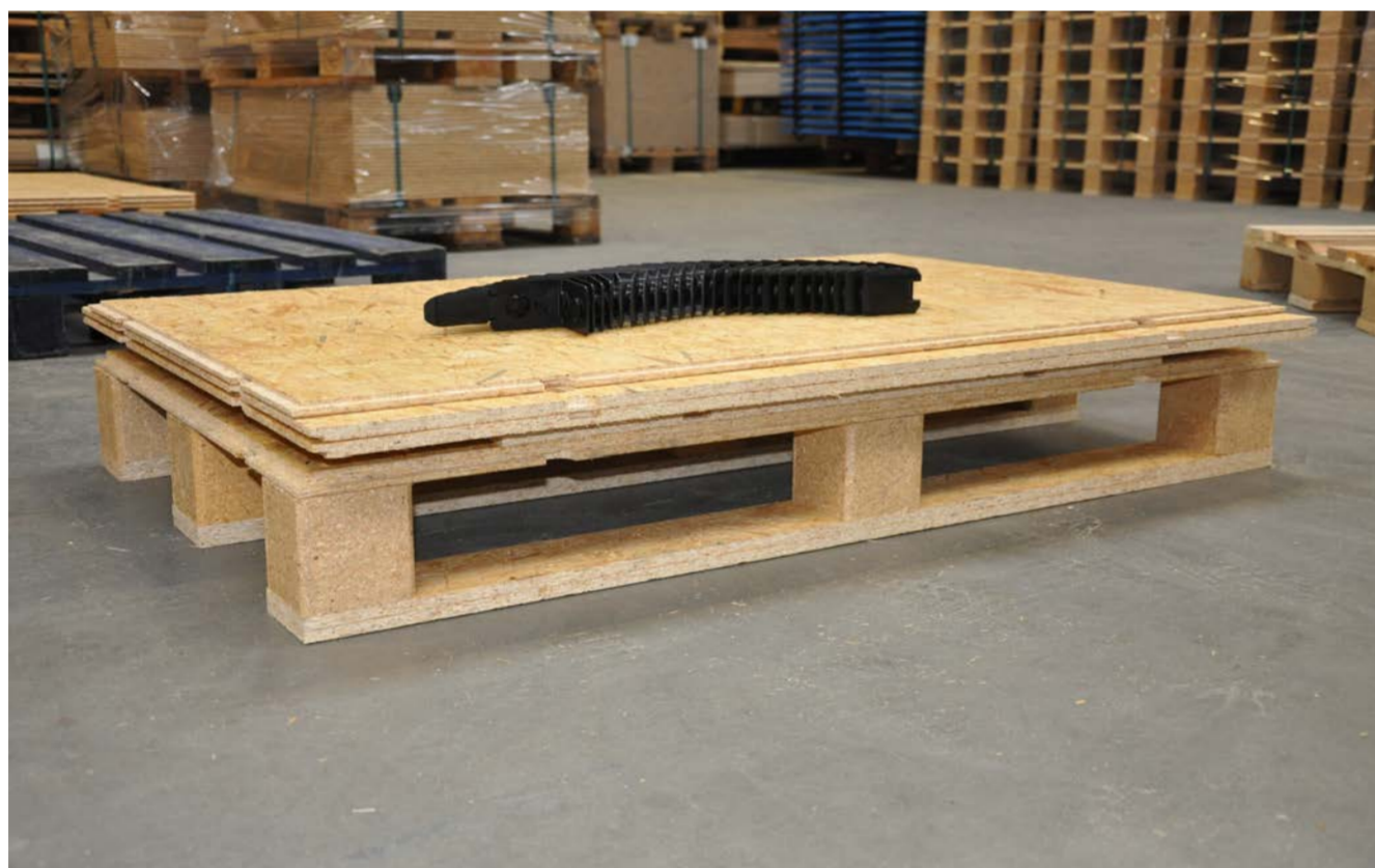
The Clip-Lok Expendable box flat-packed with Clip-Lok QIK Plastic clips.