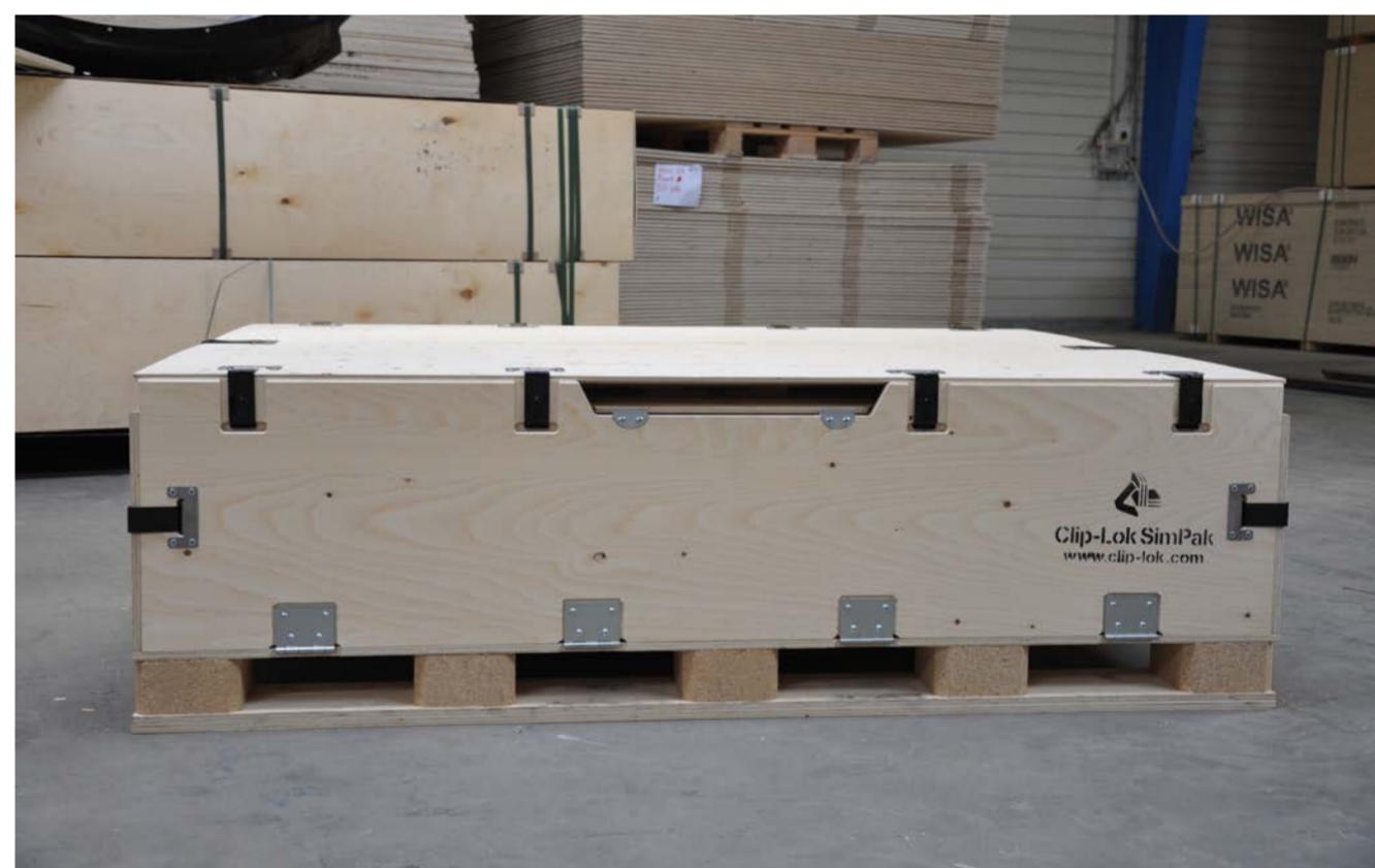
Clip-Lok 2P box for fenders flat-packed with dunnage.