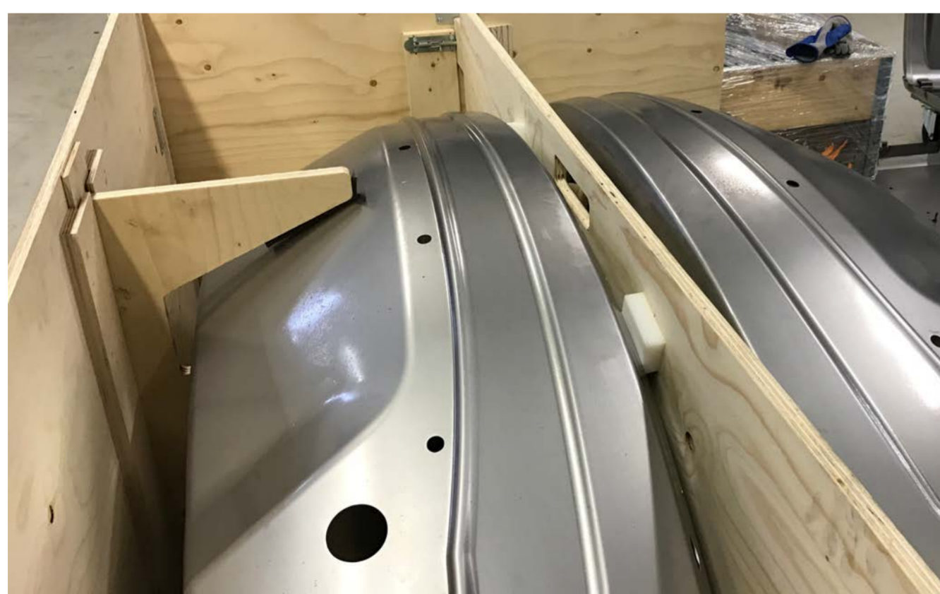
Fenders on HDPE dunnages secured for transport.