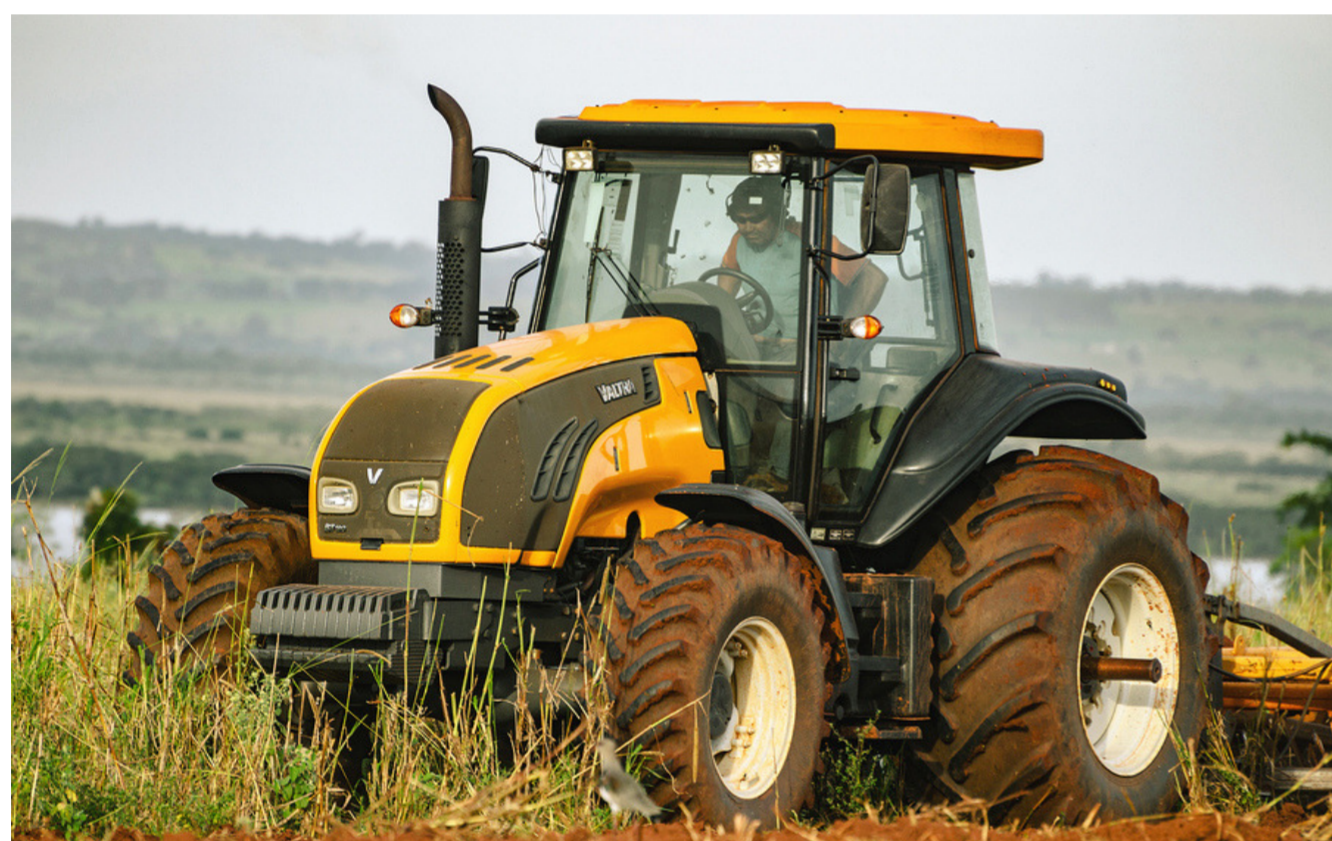
The final product - a tractor with the fender.