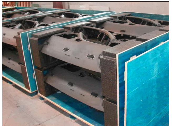
The EPP shells provide full protection and maximum packing density. Without any further steps such as unwrapping parts, the boxes can be unloaded directly on the production line maintaining an optimized flow.