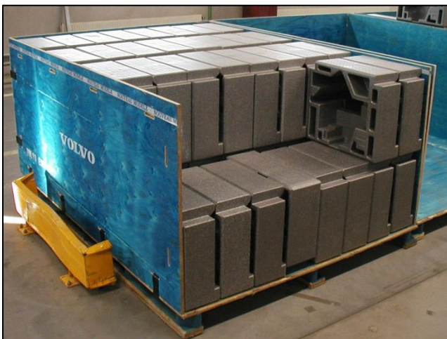
Dunnage sets for 32 dashboards can be transported in a single box. Expert craftsmanship ensures that the box will hold up under many return transports.