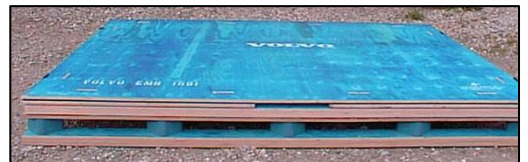
The closed box protects the parts from dirt and damage. The flat-packed box is ready for cost-saving return shipment or space-saving storage.