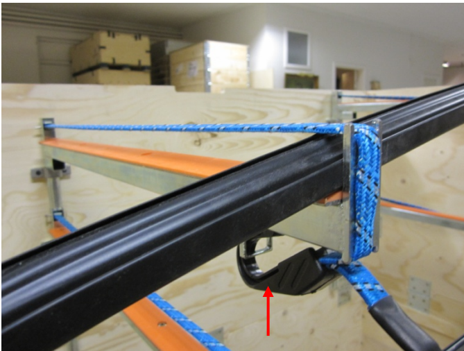
The cords lock the door seals onto the support arm.