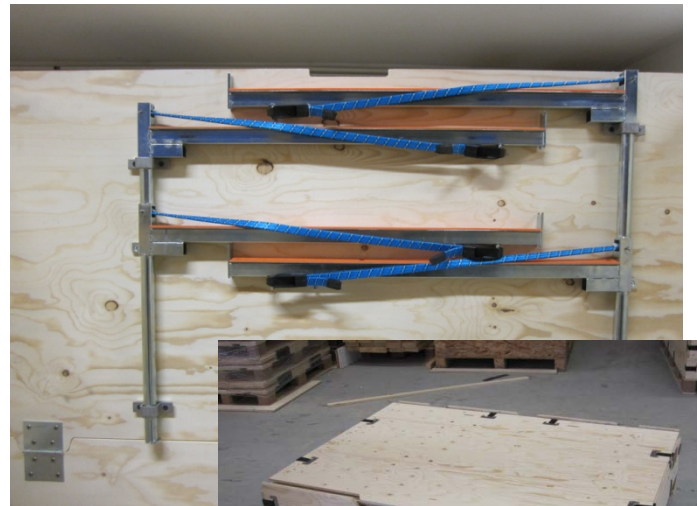
The arms and cords are folded into the box to minimize space. When the Clip-Lok box is collapsed the volume is reduced by up to 75%.