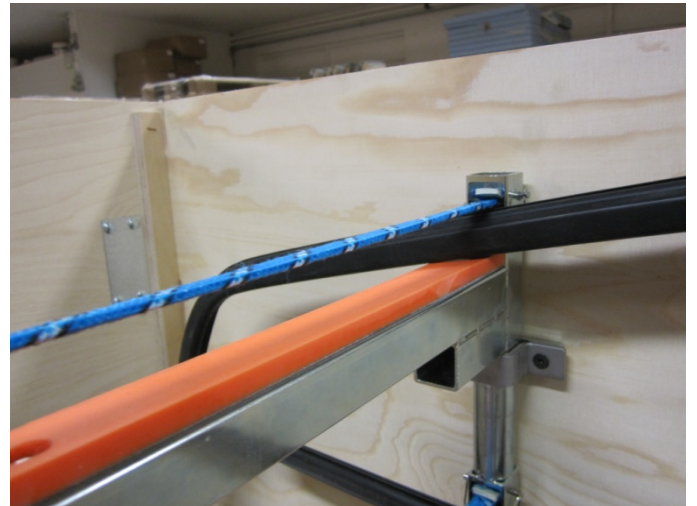
The dunnage protects the door seals from sharp edges and the cords keep the seals in position during transport.