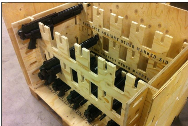
The support racks are designed to accommodate rifles of various sizes. All surfaces are carefully finished to prevent scratching.