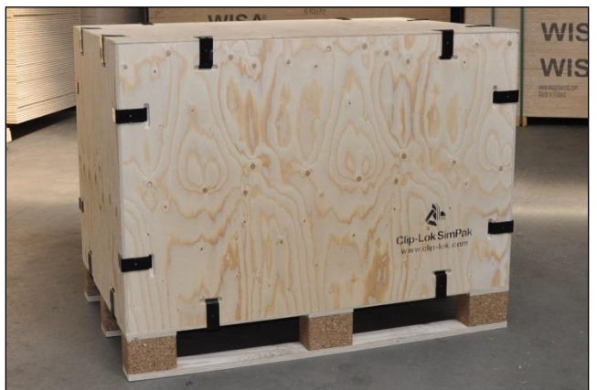
The box is assembled with externally fitted reusable spring steel clips which are easy to insert and remove. No nails or screws are used. The integrated pallet base allows 4-way handling.