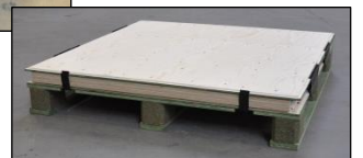
A fully assembled box and a flat-packed box. All dunnage is completely enclosed within the flat-packed box.