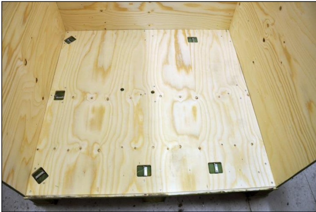
Strap connectors are imbedded in the base of the box.