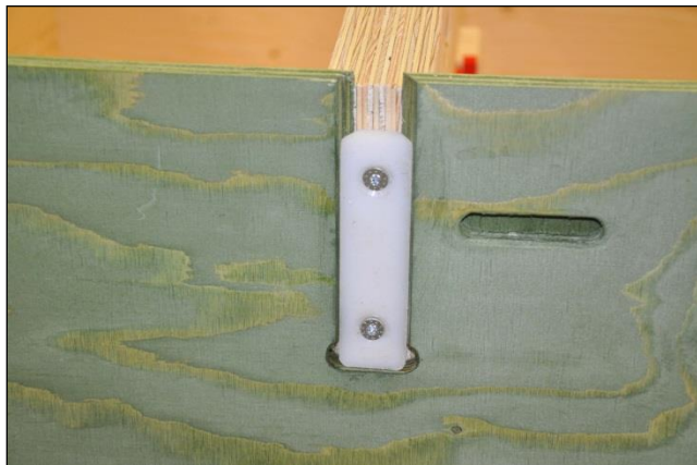
A unique dunnage locking system secures the RWS and stabilizes the box. Clip-Lok boxes can be painted and/or printed with item number, logo, text etc.