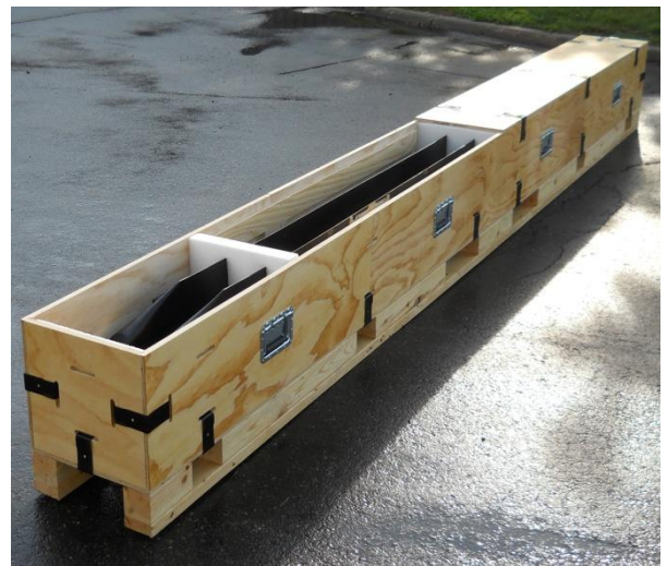
The top half of the dunnage secures the rotor blades in position. The long box top opens in two halves. The pallet runners are bevelled to enable dragging on uneven surfaces.