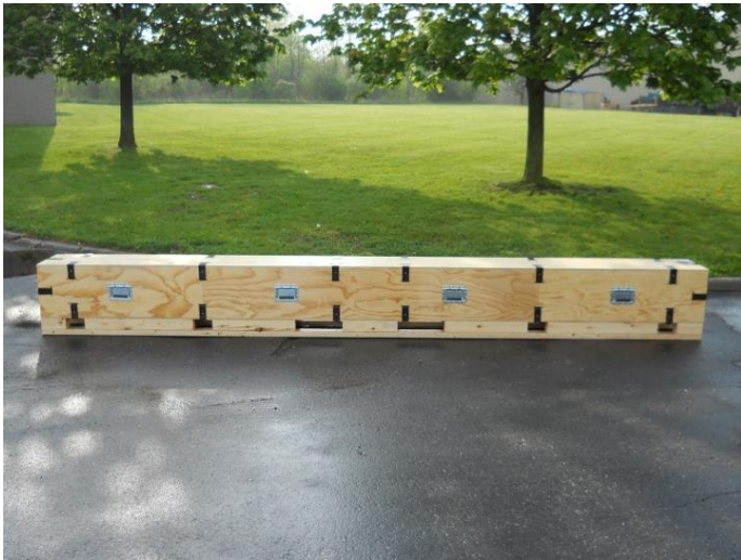
Sturdy custom-built reusable box with lifting handles and a built-in pallet base for easy handling.