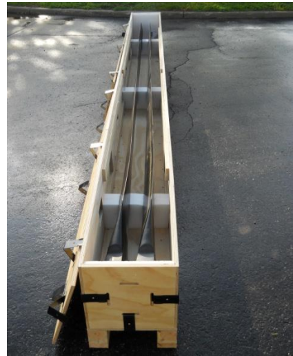
The box securely holds the helicopter blade set, each blade carefully protected by custom-engineered foam dunnage. Different dunnage can be used within the box to accommodate rotor blades from other manufacturers.