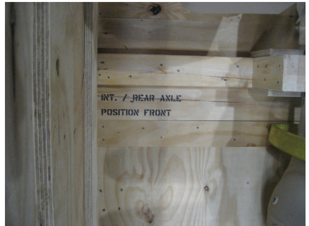
Plywood blocks ensure stable and safe transport as the axle is kept in correct position. Printing on the blocks also ensure correct positioning