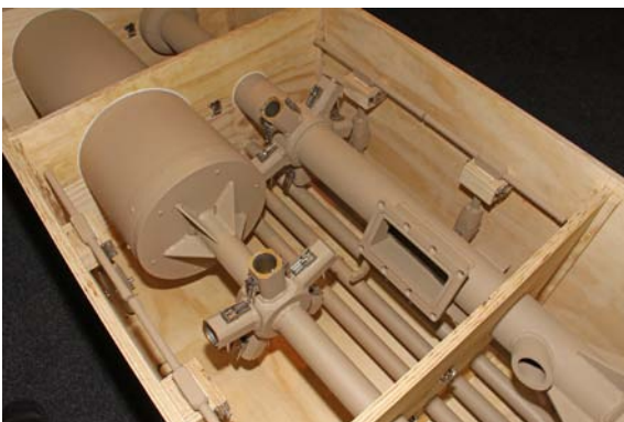
Plywood dunnage keeps the 33 individual parts securely positioned and separated to avoid scratches or damage