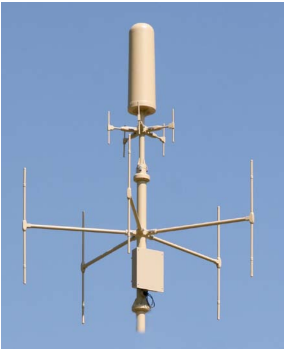
When fully assembled and erected, this Poynting antenna is 3.3m high and 2.7m in diameter