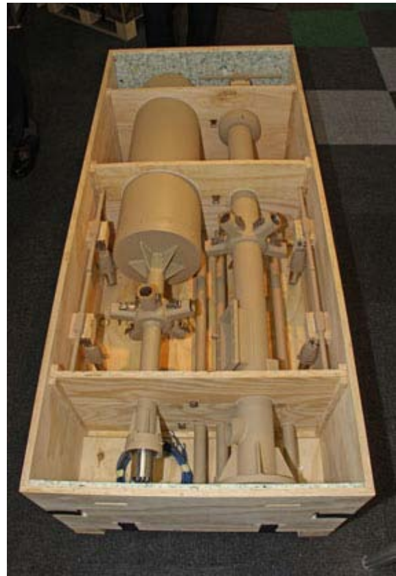
Transportation of this Poynting antenna is made in a single box, 1.6 m long, from the system integration company to its final destination