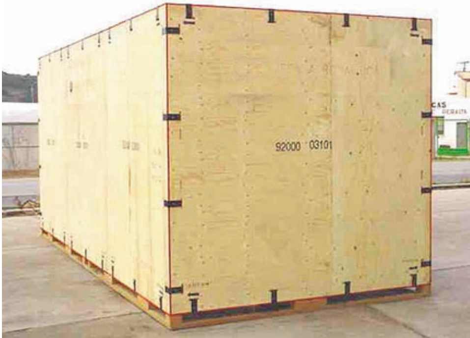
Above: Very large box with dimensions 5.500 x 2.500 x 2.500

Among our many projects within the Aerospace industry is one for the transporting of helicopter parts from Spain to the United States. In this instance, the parts are extremely large and heavy, requiring an extremely strong box and precisely crafted dunnage. The result is a Clip-Lok box in which the product is protected and secure