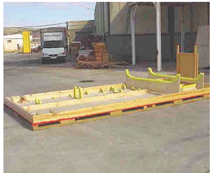
Above: Another view of the innovative dunnage design