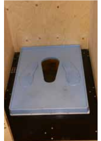
A squatting platform is held in place without screws, which ensures that it is easily removable for disinfection