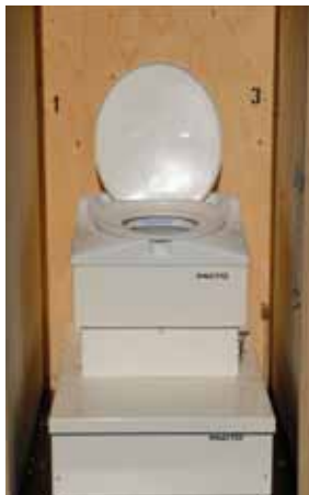
Pacto® toilet placed in cabin