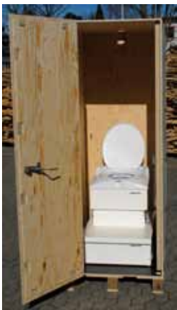
Full size toilet ready for use