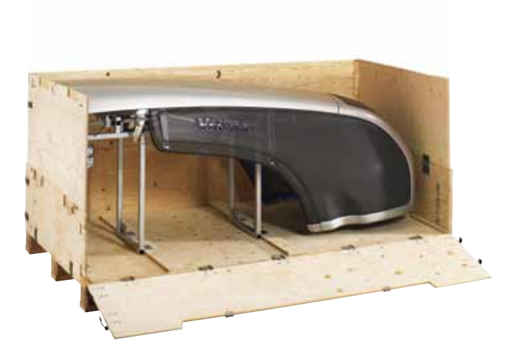
The design of the box makes it easy to handle large items. Despite the size they can still be stacked in storage.