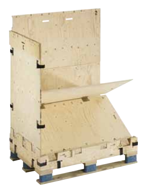
Even large and odd size boxes fold into pallet size.